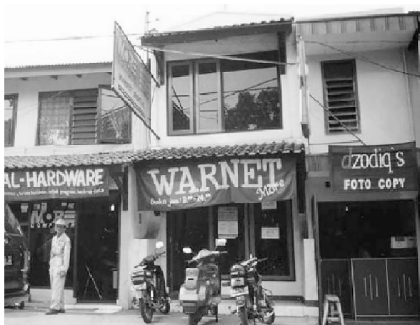
Fig 1. A warnet in Bandung, 2001.

against the control of the state. Underground mailing lists became a powerful new tool to share controversial information like news related to the Indonesian Communist Party, details of Suharto's wrongdoings, or even reports by journalists who were shut out of the mainstream media (Harsono, 1996). The most popular of these served daily dispatches with links to critical sources, and most crucially, with